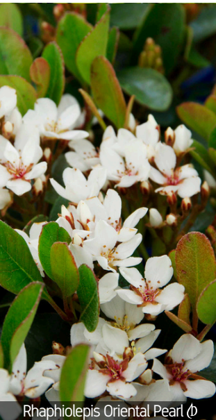
Rhamphiolepis Oriental Pearl ⌀

In commercial settings, hedging is frequently utilized to delineate pathways, outdoor seating areas, or parking lots, improving the overall organization and visual coherence of the space. Whether used in residential gardens, public parks, or corporate landscapes, hedging plants play a crucial role in shaping and enhancing outdoor environments for both aesthetic enjoyment and functional purposes.