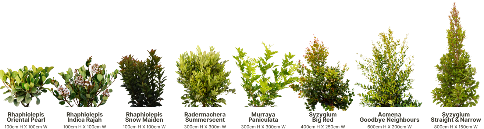
Rhamphiolepis Oriental Pearl 100cm H X 100cm W