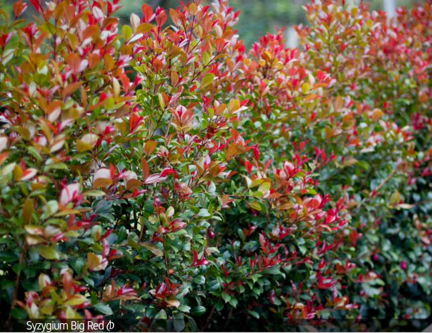
Syzygium Big Red ⌀