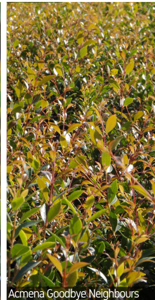
Acmena Goodbye Neighbours