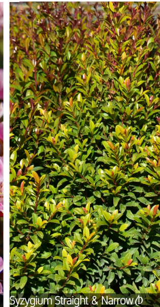
Syzygium Straight & Narrow ⌀