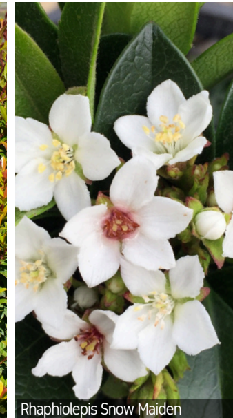
Rhamphiolepis Snow Maiden