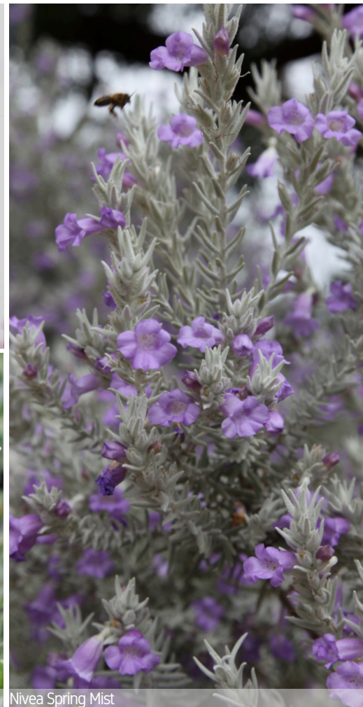
Nivea Spring Mist